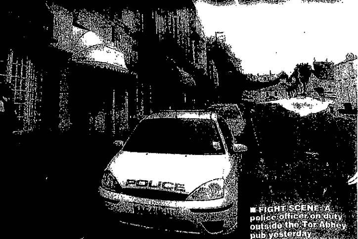
FIGHT SCENE A police officer on duty outside the Tor Abbey pub yesterday